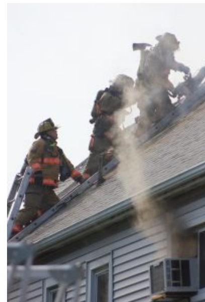
Buffalo firefighters help vent heat and smoke from a house fire on Shanley Street. August 1, 2017.

The chief agreed, he didn't have an exact time line, but he thought the scene went up in about ten minutes or less.