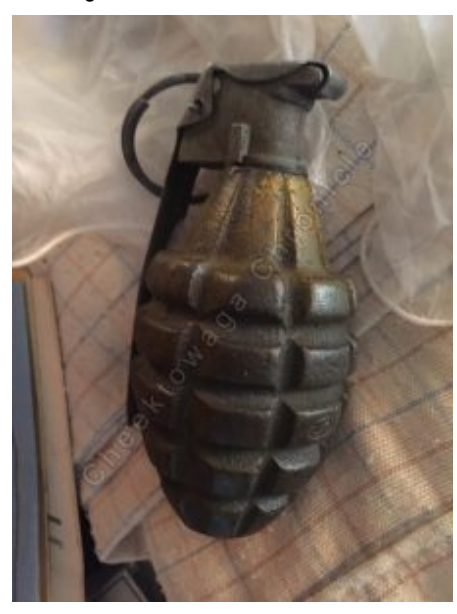
The Cheektowaga Chronicle obtained a photo of the recovered grenade on Toelsin Road.

The Cheektowaga Police filed a report for found property.