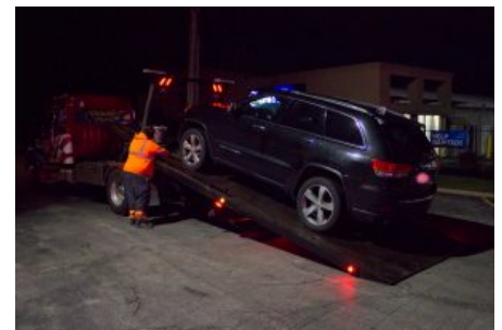
A Rusiniaks tow operator flatbeds a Jeep along Union Road after the driver