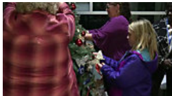
A special tree for special families