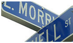
Woman faces Leandra's Law charges in ex-husband's death