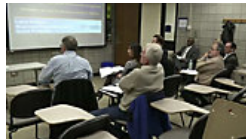
Recovery funding available for small businesses damaged by floods