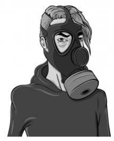
A man with green hair and wearing a gas mask was seen near the Interstate 90 underpass on Galleria Drive.

. A loud party "with bad singing" on North Seine Drive turned out to be one intoxicated man. Police took him inside.