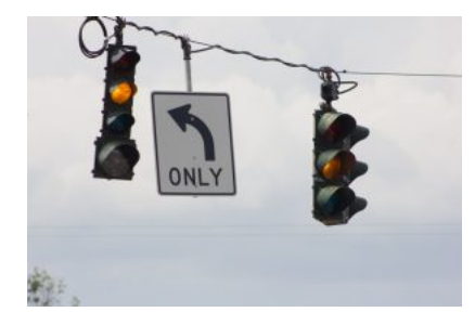
The signal light at Walden Galleria Drive and East Drive was on flash at

A town-owned traffic light at the intersection was malfunctioning at the time of the crash. Traffic on Walden Galleria Drive had a flashing yellow light and traffic coming out of the mall and post office had a flashing red light.