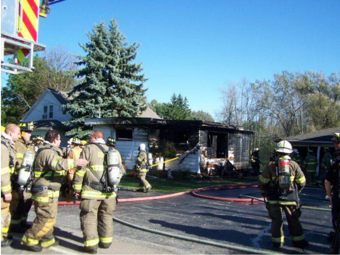
Firefighters from Cheektowaga, Lancaster, and West Seneca assist Doyle Hose at a house fire on Cayuga Creek Road.

CHEEKTOWAGA – A Vietnam veteran who served in the Marine Corps is homeless and has lost all of his possessions after a fire tore through his Cayuga Creek Road home Thursday afternoon.