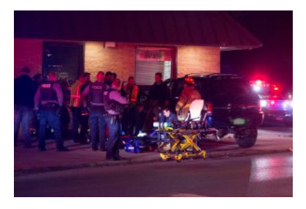
First responders work to revive a man in cardiac arrest after he crashed into Partner's Pizzeria on October 24th.

A police source tells Cheektowaga Chronicle that the department's traffic officers are documenting the scene and are trying to determine if the crash was medical related or if it was the result of some other cause.