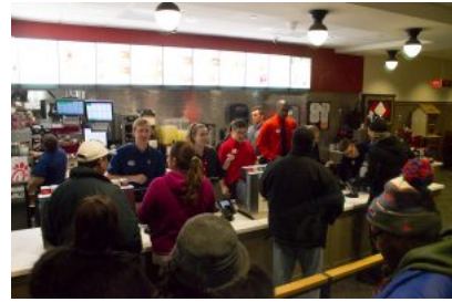
Chick-fil-A employees help the first paying customers during the restaurant's grand opening on November 29th.