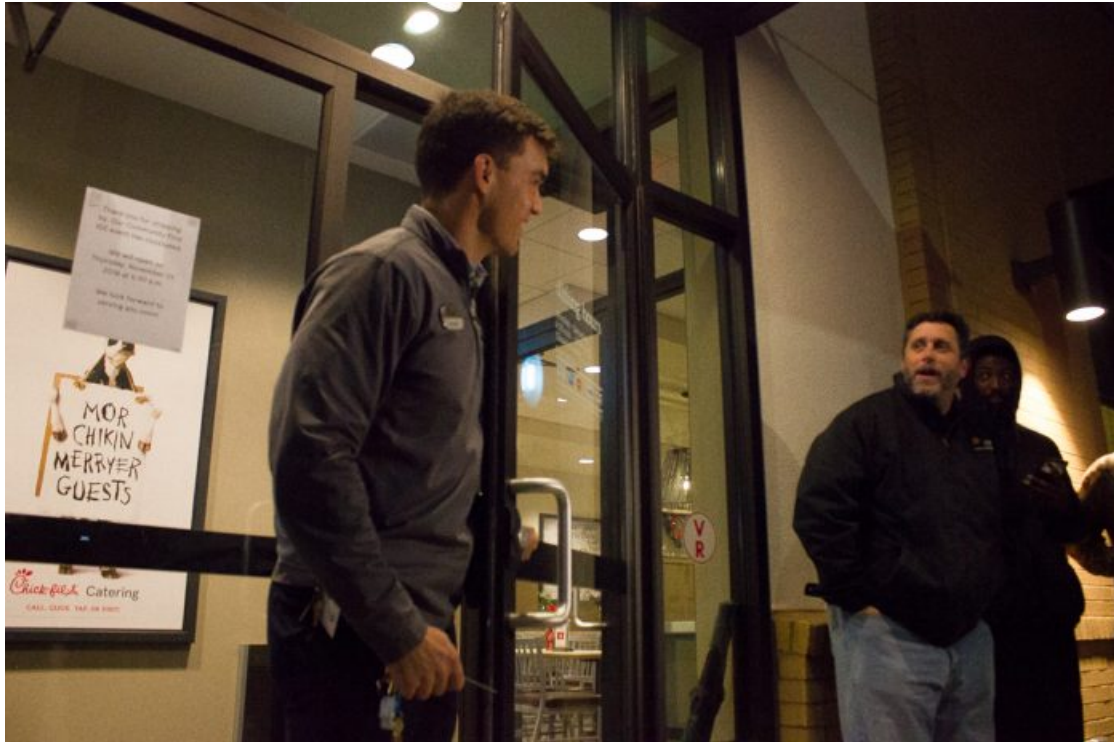
A Chick-fil-A team member welcomes the public into the new restaurant on November 26th.

CHEEKTOWAGA – Western New York’s first Chick-fil-A restaurant opened in Cheektowaga Thursday morning, and more than 100 people from the region lined up to sample the fare.