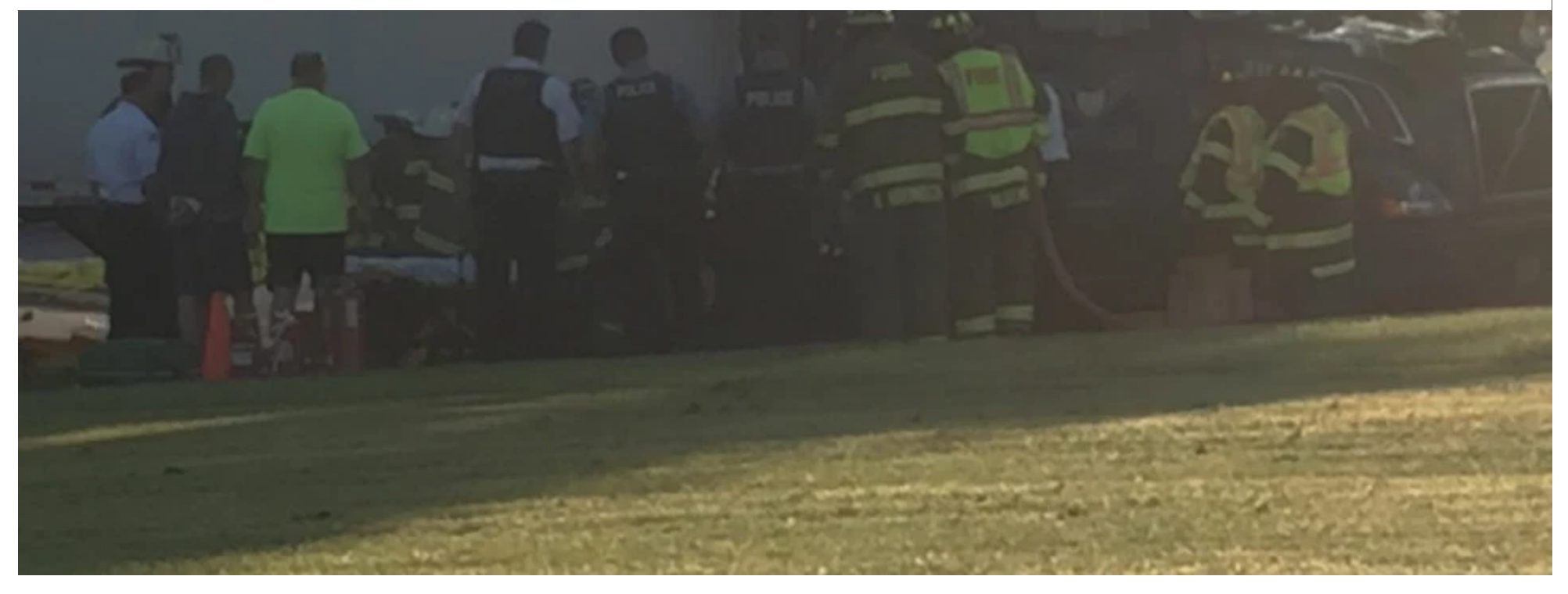
Motorcycle, tractor trailer involved in crash on Walden near Union in Cheektowaga