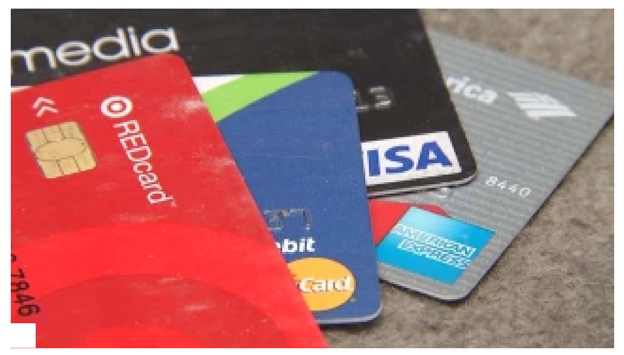
How much privacy should consumers have to give up for a credit card?