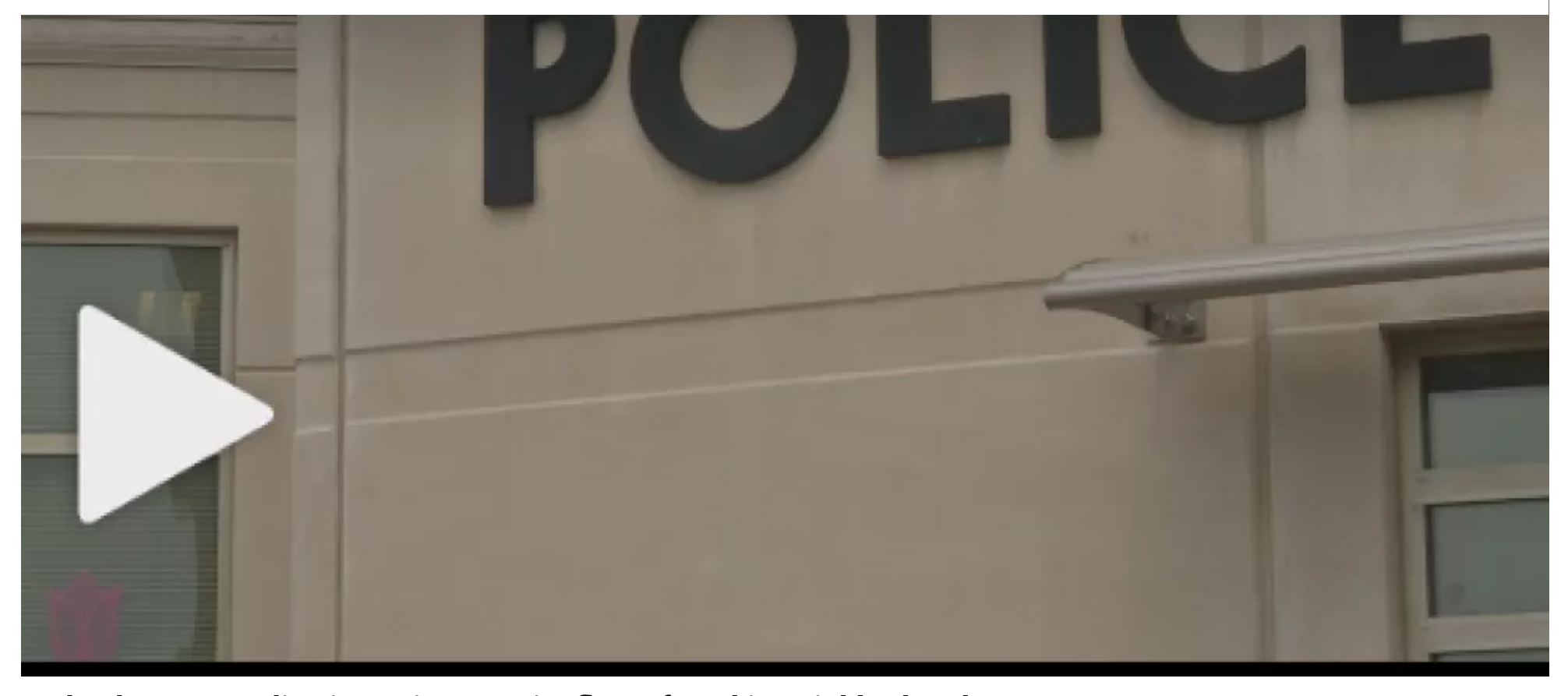
Cheektowaga police investigate racist flyers found in neighborhoods