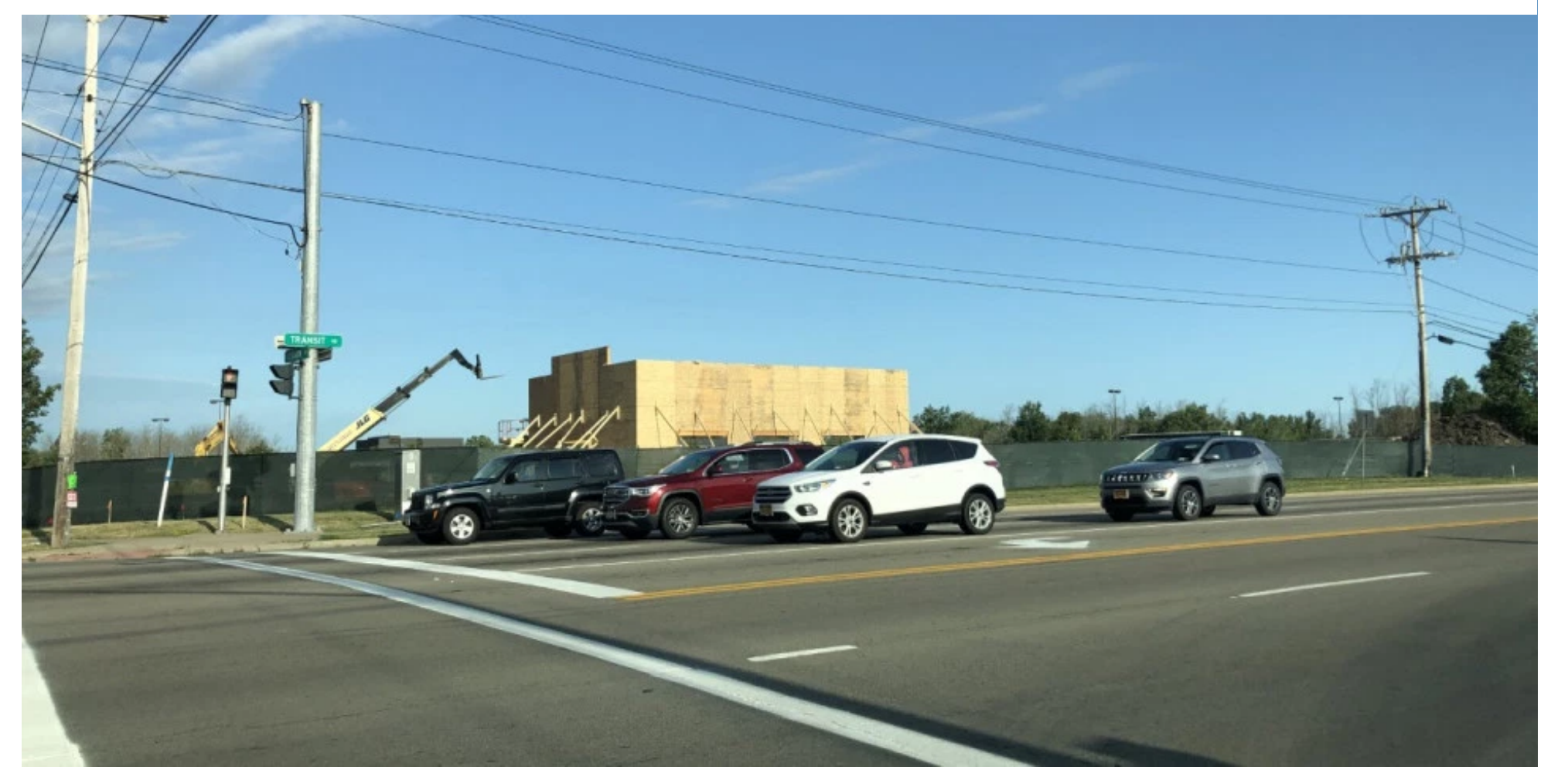
Walls going up at second local Chick-fil-A in Cheektowaga