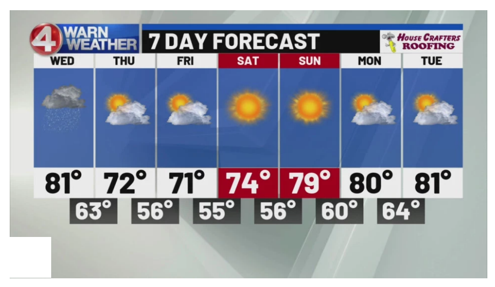
Today's oppressive humidity is gone by the weekend