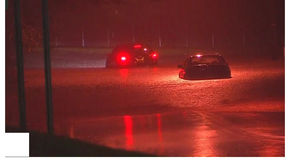
Buffalo roads reopen following flooding, but part of River Rd. remains closed