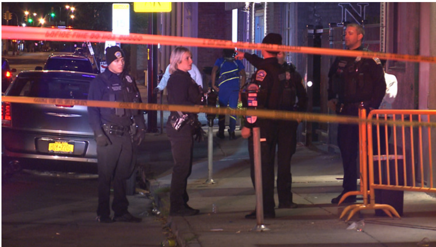
Buffalo Police officers at a scene on Franklin Street near Chippewa