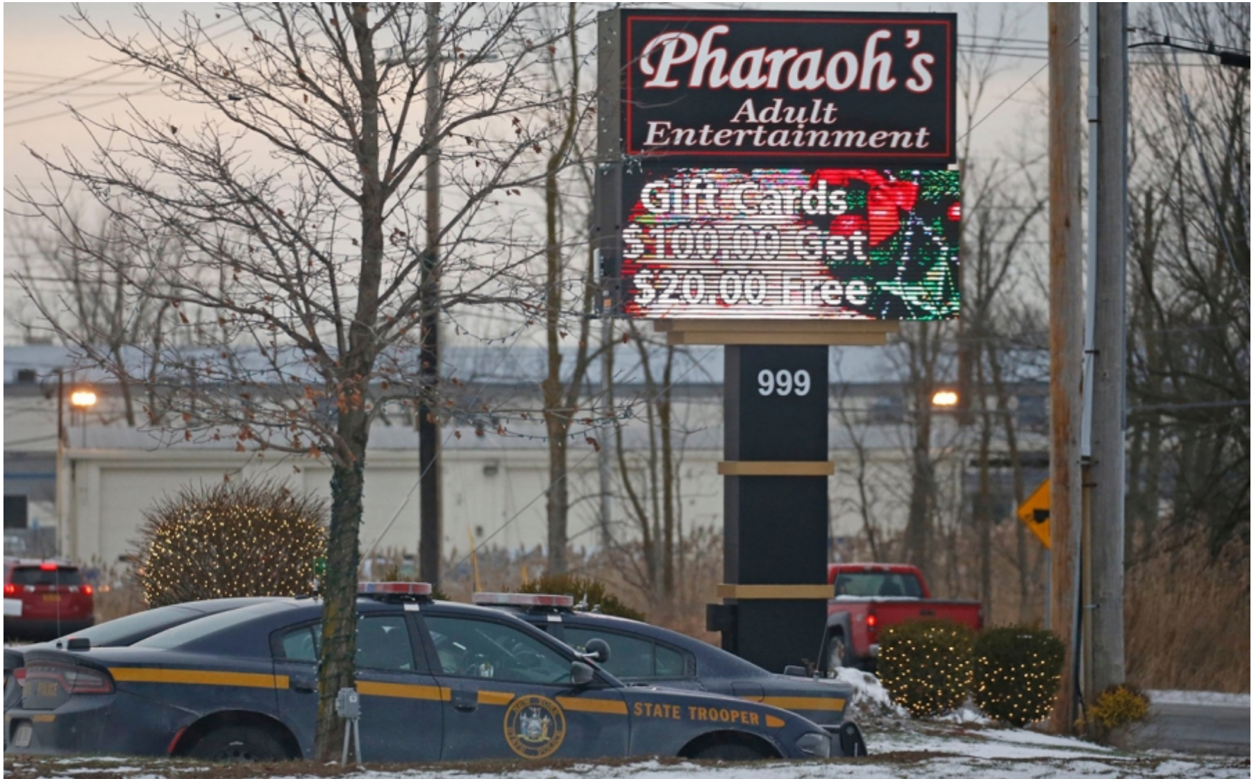
Several law enforcement outlets assembled Thursday at Pharaoh's Adult Entertainment on Aero Drive in Cheektowaga.